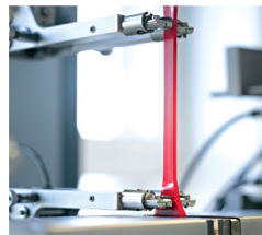
ISO tensile strength