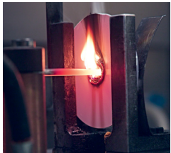
IEC glow-wire flammability/ IEC glow-wire ignition

ISO/IEC/ASTM gives users a basic understanding of the fundamental principles for additive manufacturing, with clear definitions of relevant terms. Standardizing the terminology for AM makes it easier for people involved in this field to communicate across the world.