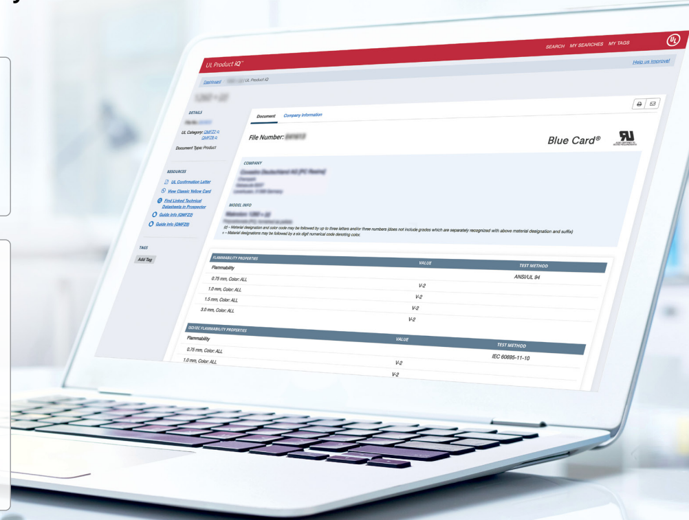
Datasheet view of a UL Solutions Blue Card on

The Blue Card provides confidence that a material will continue to meet requirements for specific applications. Using UL Solutions-tested and certified components – identifiable through the UL Recognized Component Mark on the Blue Card – can also help you save time and money. By eliminating the need for further material testing, it can help shorten the path to certain certifications.