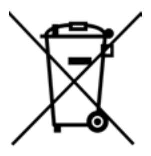
Cd (if cadmium content > 0.002%)