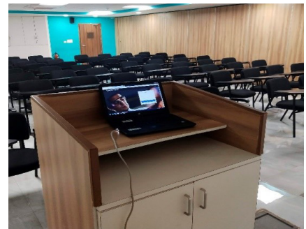
100-seater training hall to conduct Instructor-Led-Training Sessions