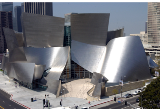
The Music Center's Walt Disney Concert Hall - credit Henry Salzar, County of Los Angeles

A landmark performing arts facility in Los Angeles, The Music Center includes a 22-acre complex encompassing four theaters and 36,000 square feet of outdoor space. One of the largest performing arts centers in the nation, The Music Center is dedicated to supporting the community and uniting people through the arts. In addition to curating artistic performances, The Music Center is also committed to excellent indoor air quality