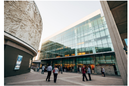
The Music Center's Ahmason Theatre credit The Music Center

While The Music Center prepares for reopening after an extended period of disruption due to COVID-19, the organization's management and its operations team feel confident that their efforts to ensure healthier