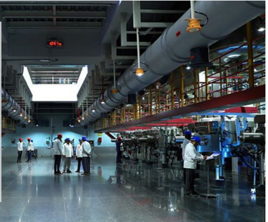
State-of-the-art Manufacturing Block.